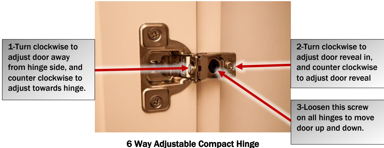
6 Way Adjustable Compact Hinge